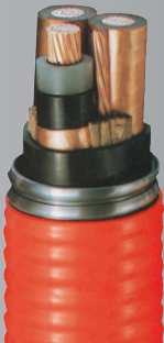
FIREX® MV Armour Power cables